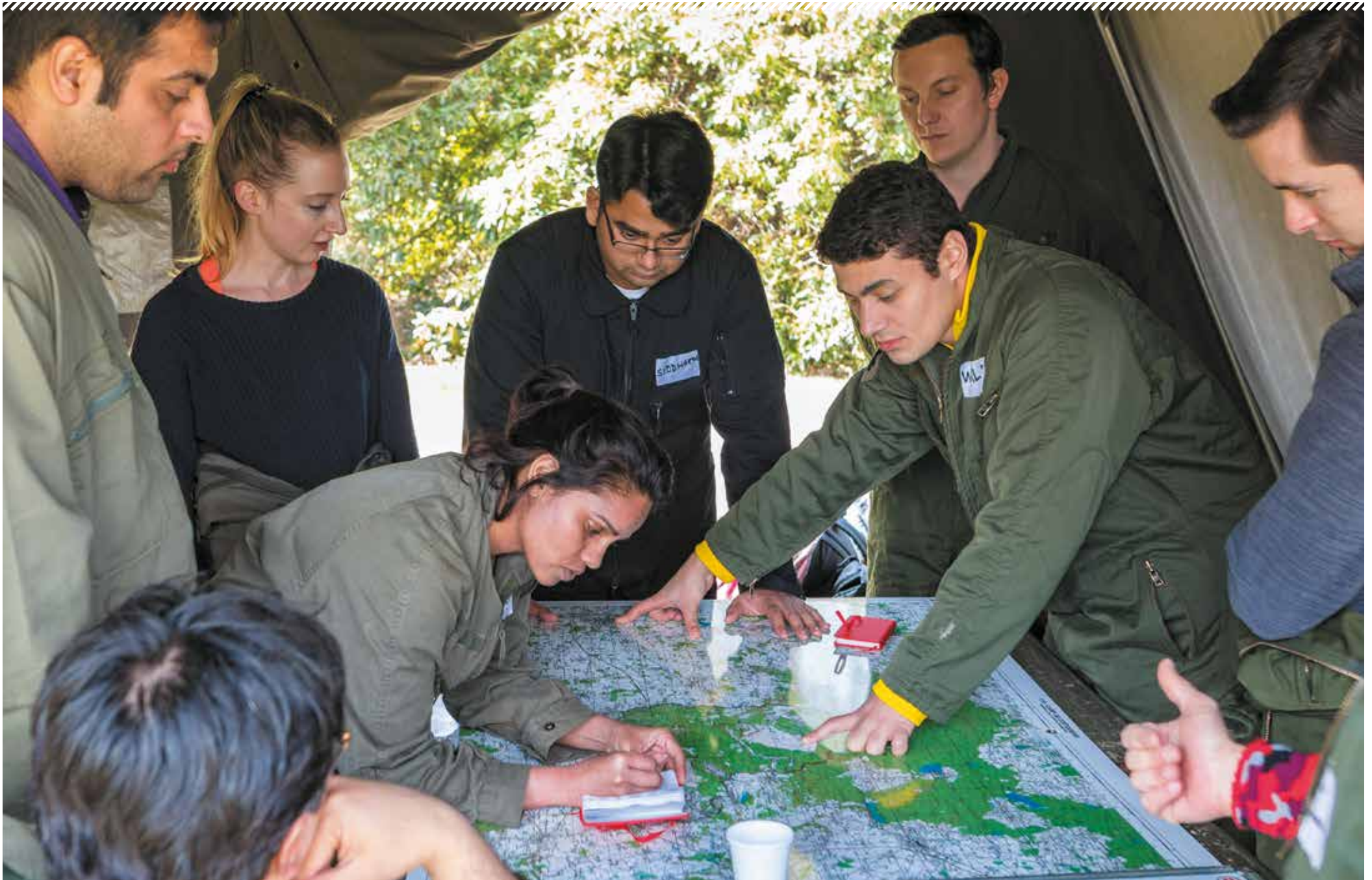
Off-campus Leadership Seminar: Leadership training requires a rigorous combination of academic theory and learning-by-doing. We teach the theories behind leadership, then provide the ideal environment to put those theories to the test.