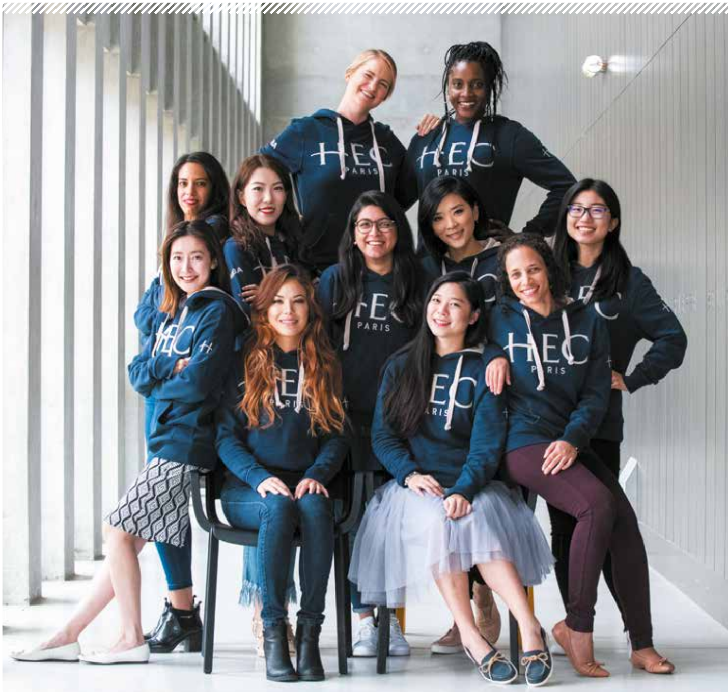
Our MBA clubs organize a wide range of on-campus speakers and workshops, including ones specifically designed to connect and empower our female students.