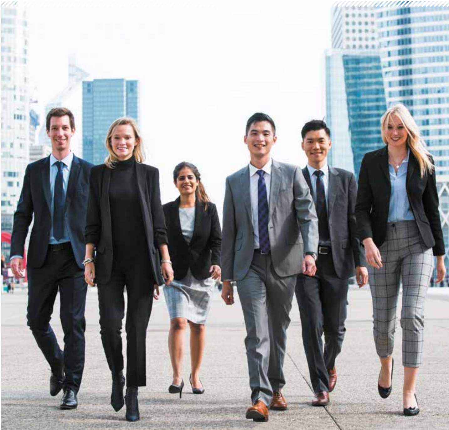
MBA students at La Défense, the largest business district in Europe and home to many of HEC Paris' corporate partners.