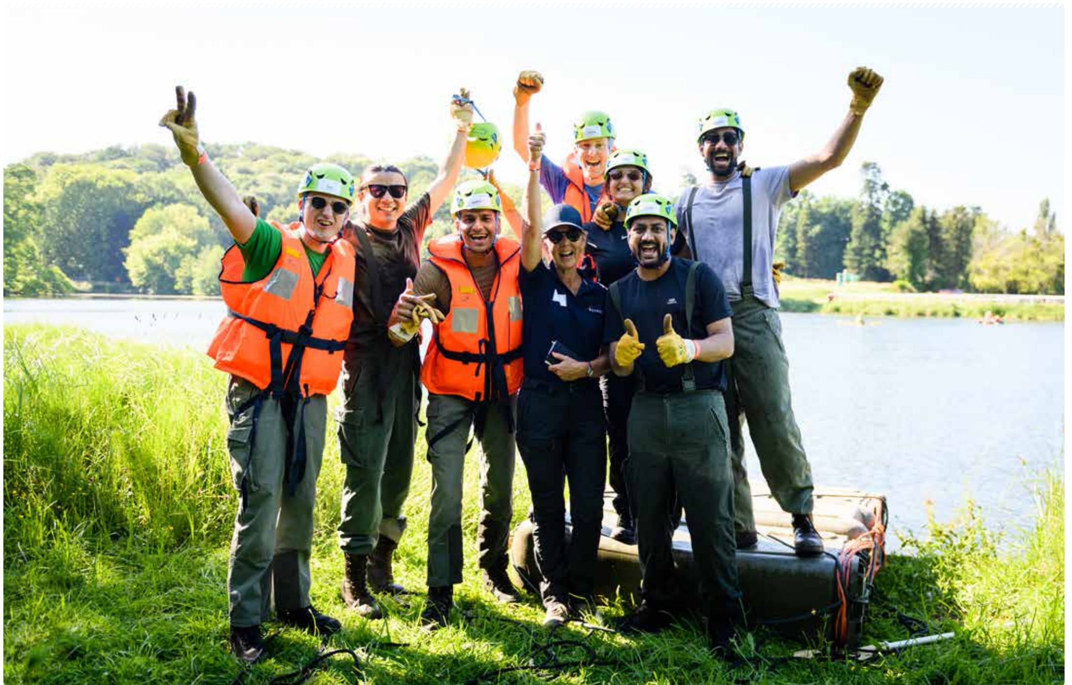
Outdoor Leadership Seminar: Leadership training requires a rigorous combination of academic theory and learning-by-doing. We teach the theories behind leadership, then provide the ideal environment to put those theories to the test.