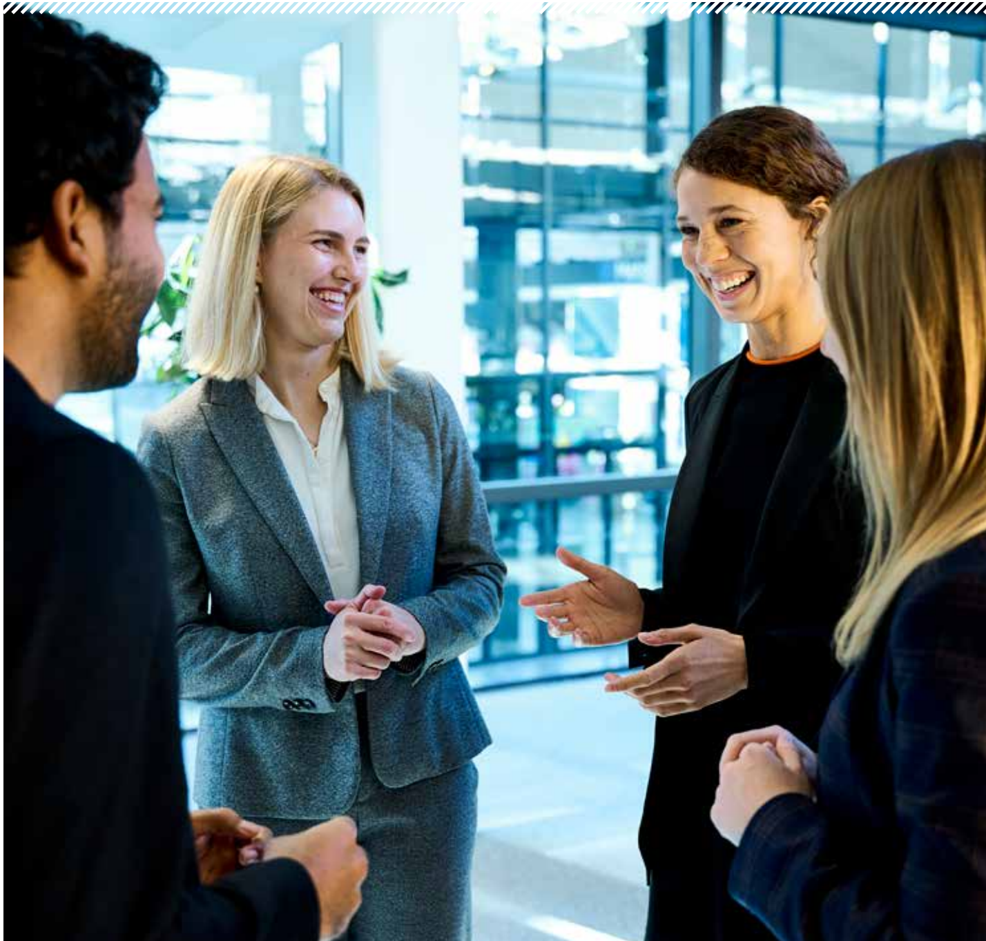
MBA students at La Défense, the largest business district in Europe and home to many of HEC Paris' corporate partners.