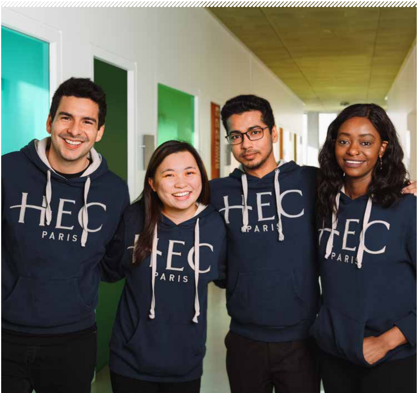
Our MBA clubs organize a wide range of on-campus speakers and workshops , including ones specifically designed to connect and empower our female students.