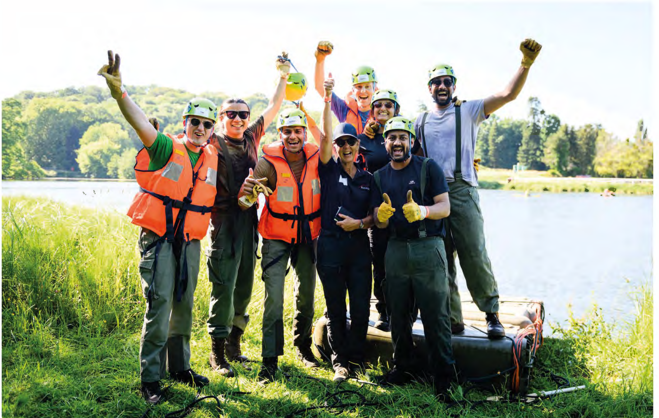
Outdoor Leadership Seminar: Leadership training requires a rigorous combination of academic theory and learning-by-doing. We teach the theories behind leadership, then provide the ideal environment to put those theories to the test.