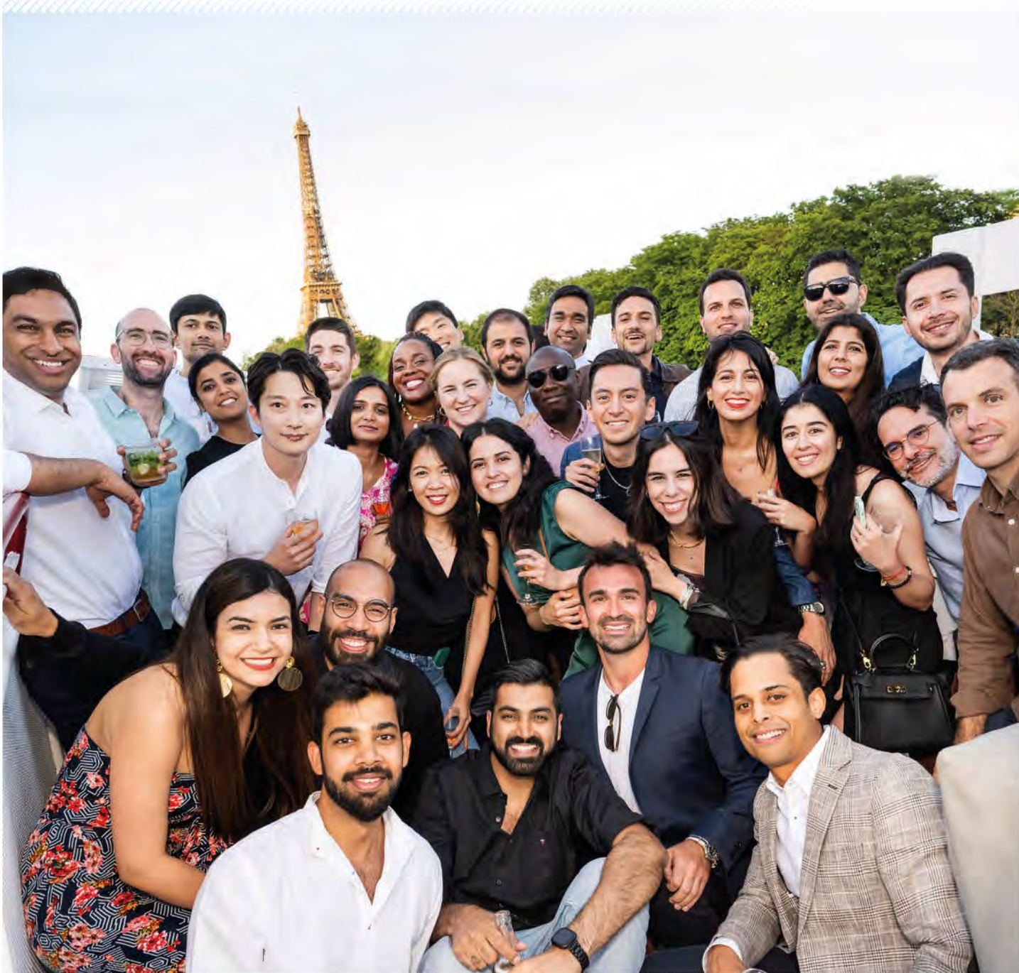
Our students benefit from an extensive alumni network , made up of more than 70,000 professionals from 150 countries .