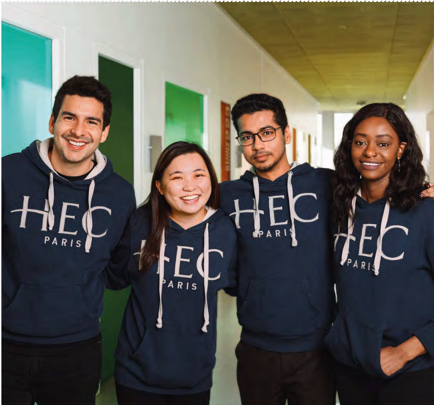
Our MBA clubs organize a wide range of on-campus speakers and workshops , including ones specifically designed to connect and empower our female students.