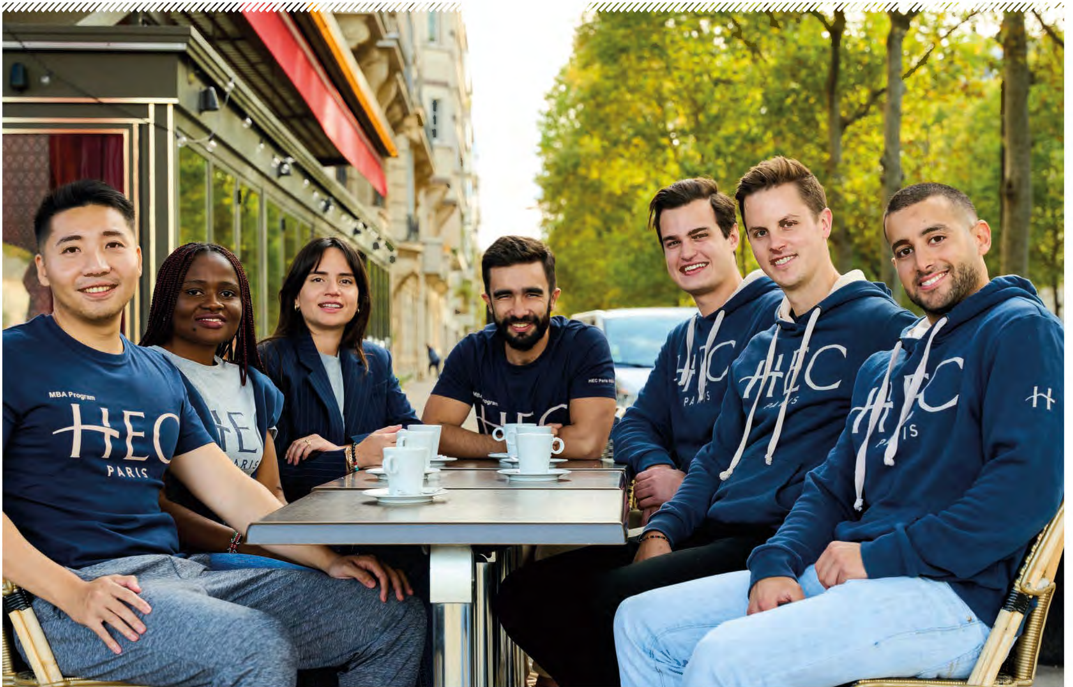
The majority of HEC Paris MBA students live in our on-campus housing, allowing you to form a close-knit community for life.